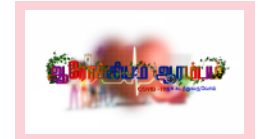
"Get Fit With Me - Overcome COVID-19"