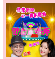
Weekly e-Getai performances