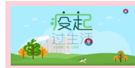
"Come 'n Live @ Zaobao.sg"

Collaborations with celebrities, ambassadors and local content creators: